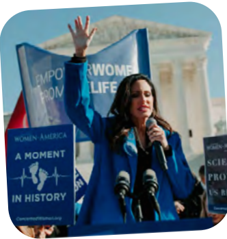
Image-bearing is the principal identity of all mankind, yet our culture has distorted that truth, dragging women down with it. At Young Women for America, we are committed to doing the opposite: rejecting the lies of our day, grounding ourselves in Scripture, and uplifting women as the precious, purposeful creations God designed. This is true female empowerment.

It's no surprise leaders across the country asked us to address this issue. We were honored to do so through our new YWA resource on Biblical Femininity. This 70-page booklet explores God's original design, highlights women of the Bible, traces the progression of feminism, confronts misconceptions about women in Scripture, and shows how Christianity and the conservative movement have historically championed women.