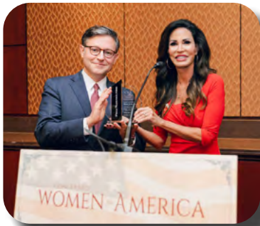
CWA honored Speaker of the House Mike Johnson (R-Louisiana 4th) with the 2025 William Wilberforce Award!

Conservative leaders around the country commend Mike Johnson for his leadership.