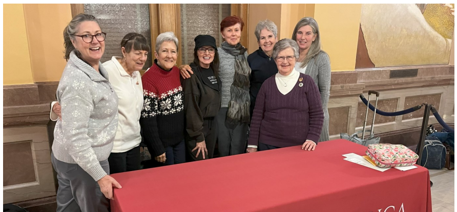
CWA of Kansas introduced CWA to those attending a Bible reading and prayer event at the state capitol.