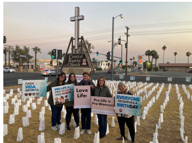
CWA of California participated in the Speak Up Imperial Valley Rally event that featured a display of luminaries representing the lives lost to abortion and testimonies were shared by abortion survivors and post-abortive women.