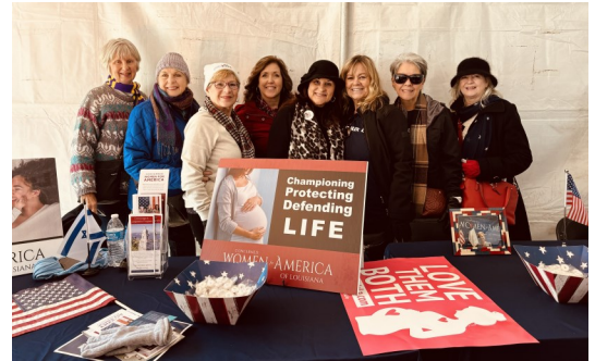
CWA of Louisiana introduced CWA to the attendees of the March for Life at the state capital.

Update on our Encourage-A-Legislator (EAL) program: It now covers more legislators than it ever has; 2,600 state legislators are being prayed for and have begun to receive encouraging postcards on a regular basis. This will continue throughout their legislative session. Pray the Holy Spirit works through this program and that every legislator is brought closer to the Lord as a result.