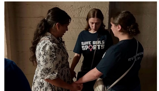
YWA Inland Empire chapter members and family gather to pray outside the Riverside Unified School Board Meeting.