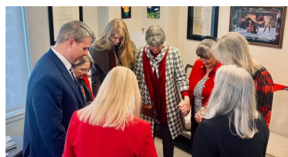
CWA of Virginia's legislative team regularly visits the capitol to take a stand on bills, pray with legislators, and lobby legislators and staff.