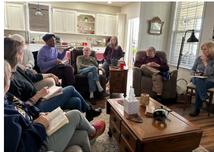
CWA of Virginia's Lynchburg City Prayer/Action Chapter discussed local, state, and national issues important to them.