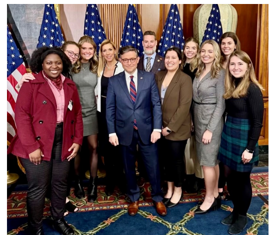
CWA Staff with Speaker of the House, Mike Johnson, at a press conference after the House passed the Protection of Women and Girls in Sports Act.