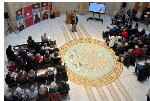
CWA of New Mexico's 2025 Rally for Life, Save the Babies , was a great success with excellent speakers and standing room only!