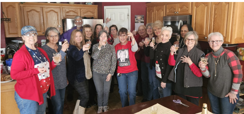
CWA of Missouri's Branson/Taney County Chapter Prayer/Action Chapter watched the inauguration together. They prayed for our country and toasted President Trump with sparkling cider!