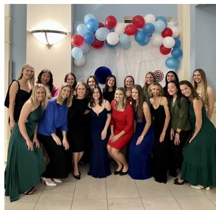
I enjoyed time with the chapter at Liberty University in Lynchburg, Virginia. I was blessed to speak at their Veteran's Day Formal with over 100 students in attendance.