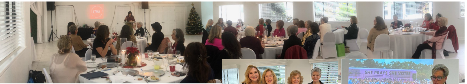
↻ Several CWA of Louisiana Prayer/Action Chapters combined for a Christmas luncheon. The neat thing is that they used a facility that houses and employs women who were once homeless and sex trafficked.