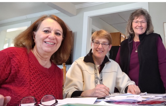
↻ CWA of North Dakota & CWA of Virginia sending out their Encourage-A-Legislator packets to volunteer encouragers.