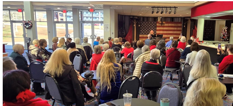
↻ CWA of Missouri's Branson Prayer/Action Chapter and friends enjoying their annual Christmas luncheon. Speakers this year included the wives of two state legislators.