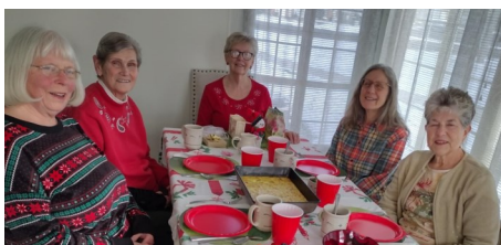
↻ CWA of Pennsylvania's Pottstown Prayer/Action Chapter enjoying their Christmas brunch.