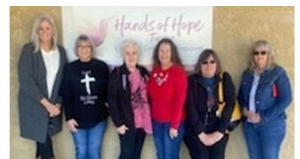
ⓘ CWA of Arizona's Tucson Prayer/Action Chapter enjoying a tour and time of prayer at the local pregnancy center Hands of Hope.