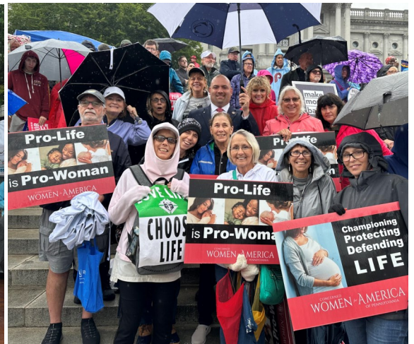
↑ CWA of Pennsylvania shows up faithfully every year at their state capital in Harrisburg for the March for Life.