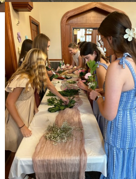
The YWA chapter at Grove City College hosts a garden party where they arranged flowers and discussed Biblical femininity.