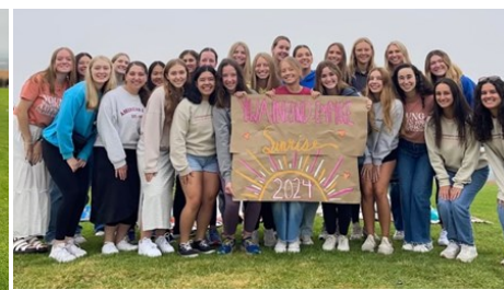
YWA Inland Empire at their kickoff sunrise event.