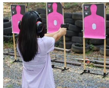
The YWA chapter at Patrick Henry College enjoyed a gun safety course and range day!