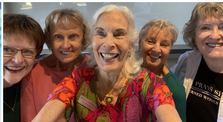
↑ CWA of Texas's steering committee gathered in Houston to plan for the 2025 legislative session.