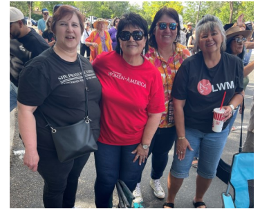
CWA of New Mexico is showing up and active! They participated in the Kingdom to Capitol event at their state capitol with hundreds from around the state (above). Multiple Prayer/Action chapters are meeting monthly across New Mexico, like this one in Santa Fe (below).