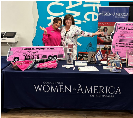
CWA of Louisiana enjoyed promoting opportunities for involvement at the Pro-Life Summit in Baton Rouge including their up-and-coming role in a She Prays She Votes