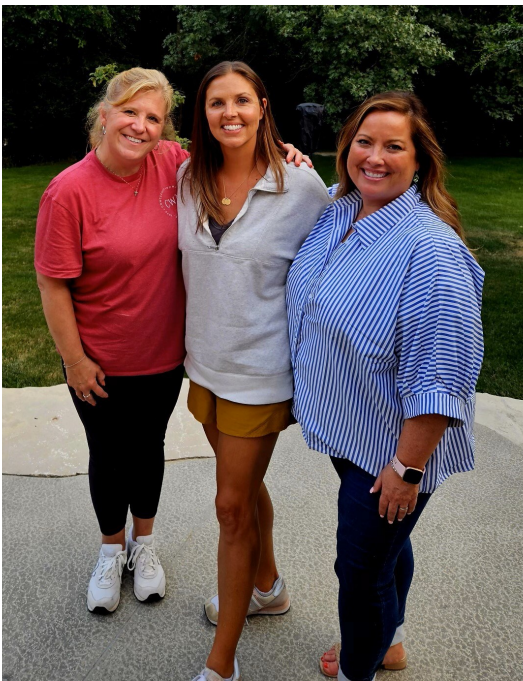
CWA of Illinois started two Prayer/Action Chapters in June. Watch out Kankakee and Danvers, CWA is on the move!