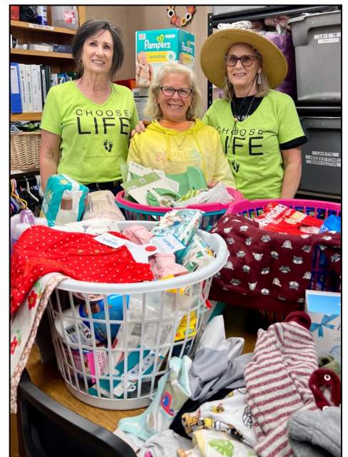
CWA of Arizona's Quad City Prayer/Action Chapter concluded a project in which they collected over $3,000 worth of supplies and delivered them to the Prescott Community Pregnancy Center. They would like to thank the multiple organizations and churches that contributed. Thank you to Heights Women's Bible Study, Vital Moms, Taco Church, American Lutheran Church, and the many individuals who generously donated.