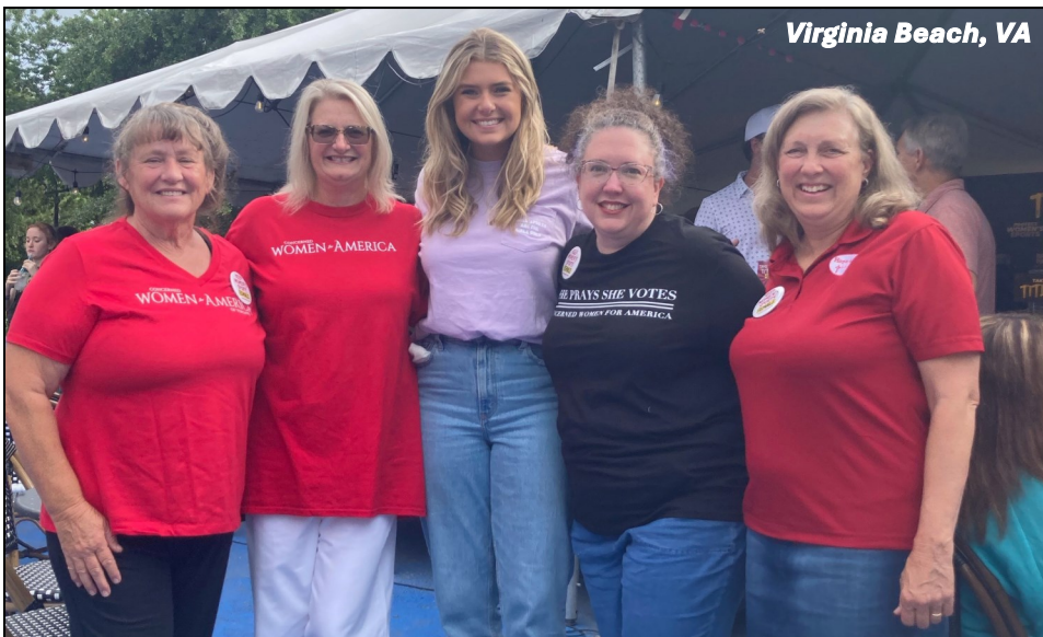
Virginia Beach, VA