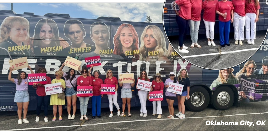
Oklahoma City, OK

CWA of Oklahoma, Pennsylvania, and Virginia rallied with female athletes in support of the Take Back Title IX bus tour led by a coalition of organizations of which CWA was a part.