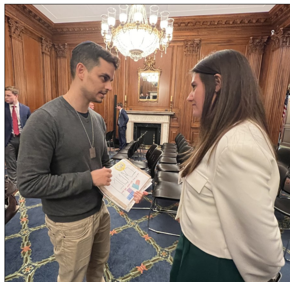
Bibas' cousin shows Valerie the Batman drawing.

After the ceremony concluded, I met a cousin of Ariel and Kfir Bibas , the 4-year-old and 11-month-old children, respectively, who were taken as hostages on October 7 and remain in captivity. The children's cousin shared with me that after the attack, officials investigating the Bibas' found a drawing done by 4-year-old Ariel – a picture of buildings