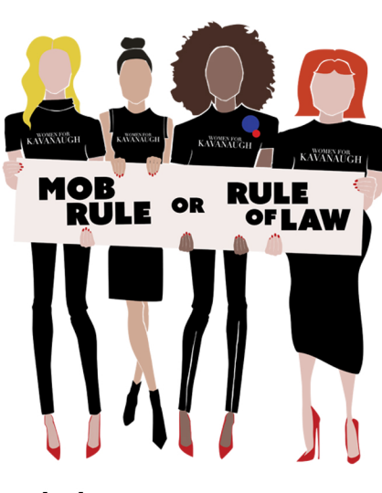
It's up to you.