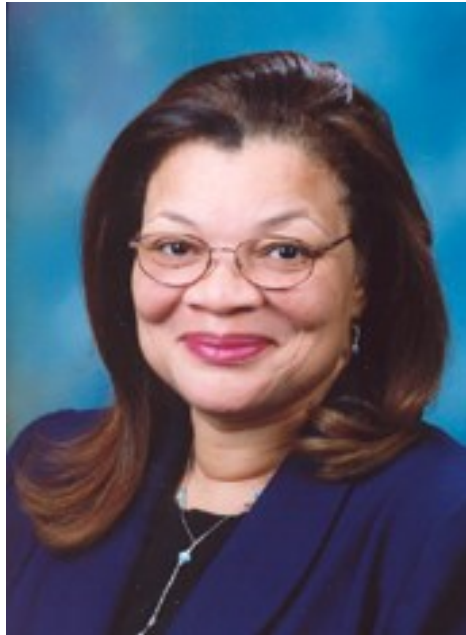
KEYNOTE: ALVEDA KING Founder of Alveda King Ministries and niece of Dr. Martin Luther King, Jr

The half-a-billion dollars given to Planned Parenthood each year by the federal government should be shifted to support the 13,000 Federally Qualified Health Centers that provide care to women and families across the country.