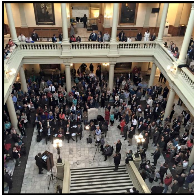
Second religious freedom rally took place on March 3, 2015 at the State Capitol.