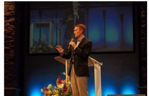
Congressman James Lankford