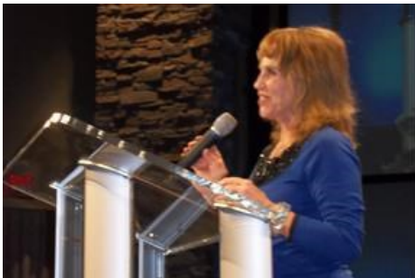
Sheridan welcomes the attendees