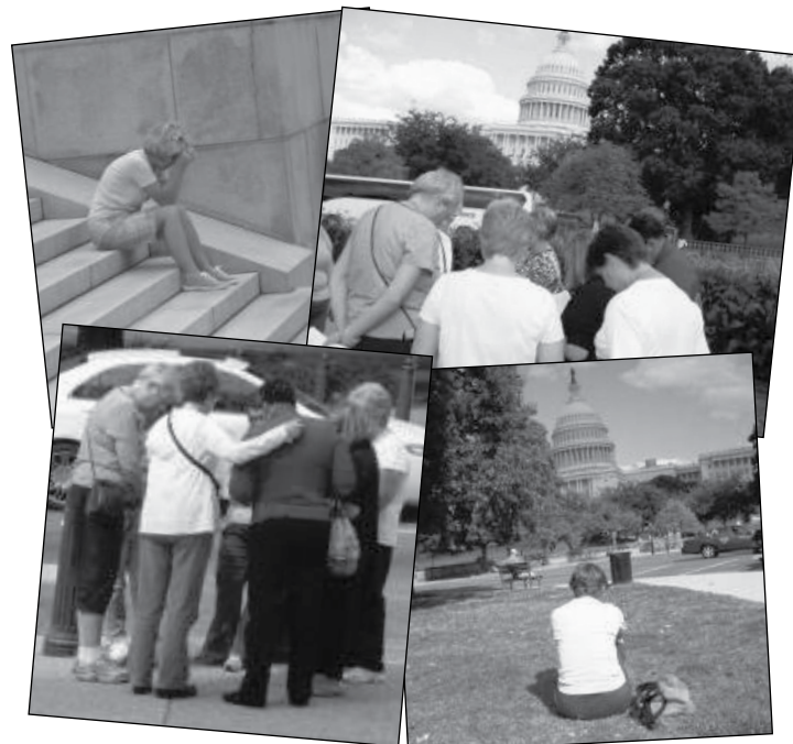
Prayer walk in our nation's capitol

Interestingly, when our group prayed on the steps of the Supreme Court, which should be the bastion of freedom, we were stopped. The policeman told us that we could not "demonstrate" on the steps, but we could "demonstrate" on the sidewalk, as that was public property but the steps were federal property. Sadly, peaceful prayer is considered a "demonstration." I believe that our Founding Fathers, who founded this nation on Christian principles, would be appalled. James Madison said, "I believe there are more instances of the abridgement of the freedom of the people by gradual and silent encroachments of those in power than by violent and sudden usurpations."